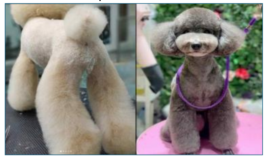
Examples of Korean-Fusion

At HYPONIC, we encourage groomers to showcase their creativity, allowing complete freedom in facial styling. For participants wishing to add additional design elements, an extra 15 minutes will be provided.