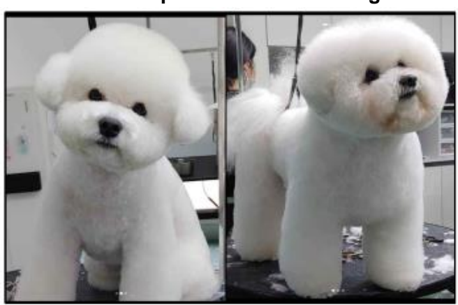
Examples of Full-Scissoring

At HYPONIC, we encourage groomers to showcase their creativity, allowing complete freedom in facial styling. For those wishing to add additional body design elements, partial use of clippers is permitted, and an extra 15 minutes will be provided.